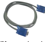
6ft Combo KVM cascade cable