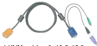
Combo 4-in-1 KVM cable - 6, 10 & 15 ft