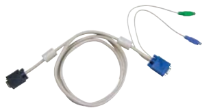
PS/2 3-in-1 KVM cable 6ft, 10ft, 15ft & 33ft available