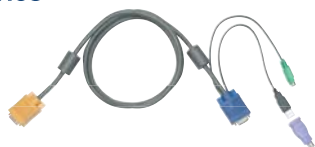
Combo 4-in-1 KVM cable - 6, 10 & 15 ft