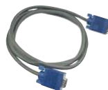
6ft Combo KVM cascade cable