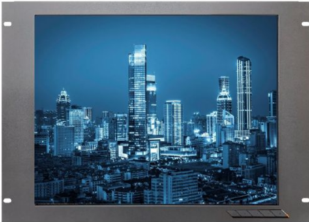
RMP-161-19R Rackmount Display Panel