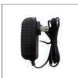
12V DC adapter